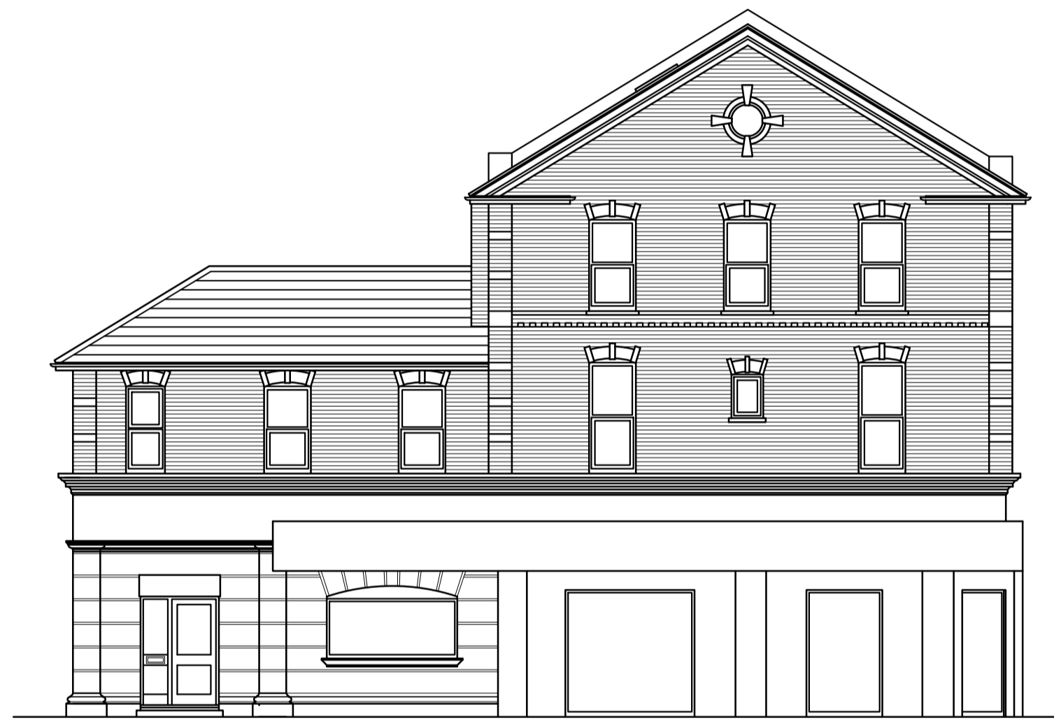
Existing Side Elevation (As at present with installed uPVC window frames)