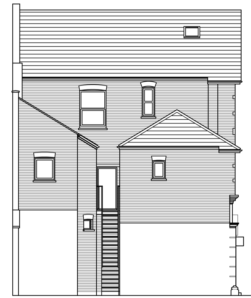
Existing Rear Elevation (As at present with installed uPVC window frames)