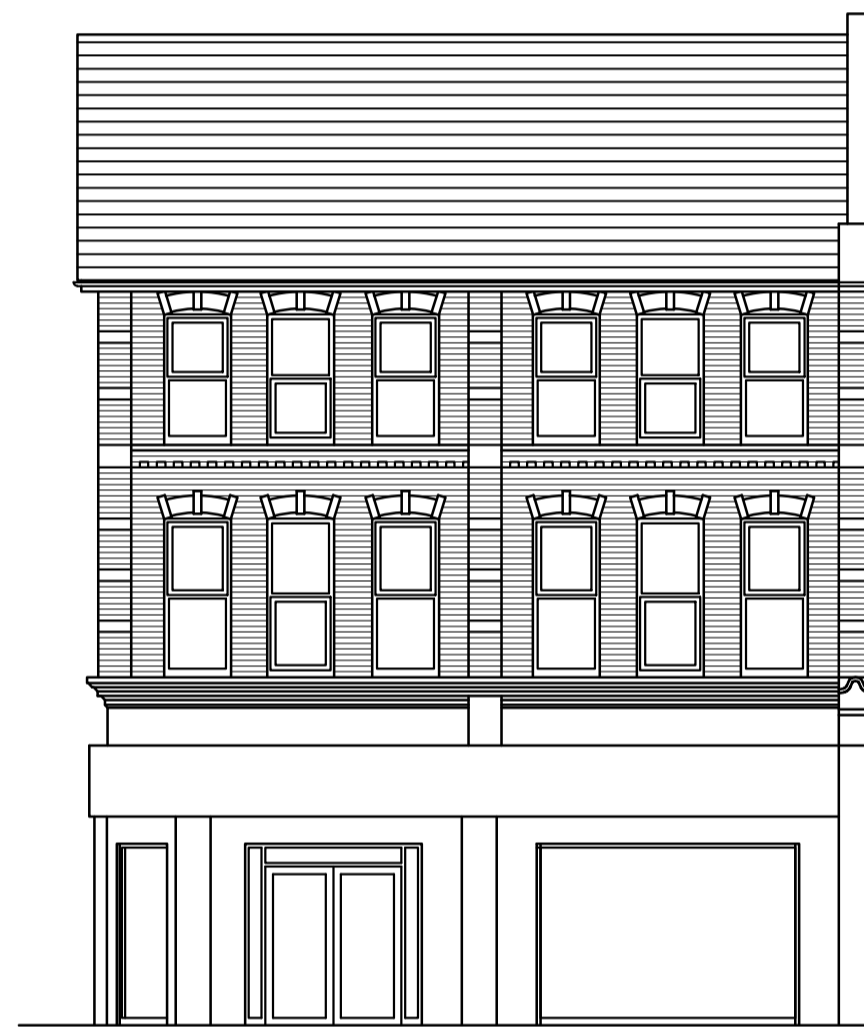
Existing Front Elevation (As at present with installed uPVC window frames)